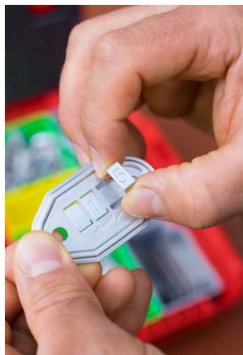
Second step: Click the pre-marked number inserts into the number plate.