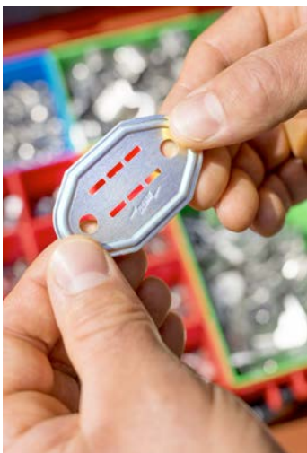
First step: Take the pre-punched number plate from the assortment case.

Easily recognisable and weather-proof marking makes it easier to regularly check and maintain the lightning protection and earth-termination system according to IEC/EN 62305-3 1) at a later date. This ensures permanent documentation of the lightning protection and earth-termination system according to DIN 18014 2) and Supplement 3 of DIN EN 62305.