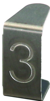
Figure without obligation