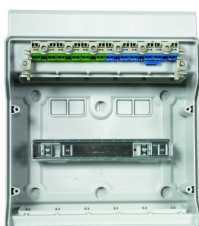
Integrated plug-in terminal technology for PE and N conductors.